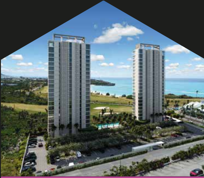
Fourteen Towers Mullet Bay