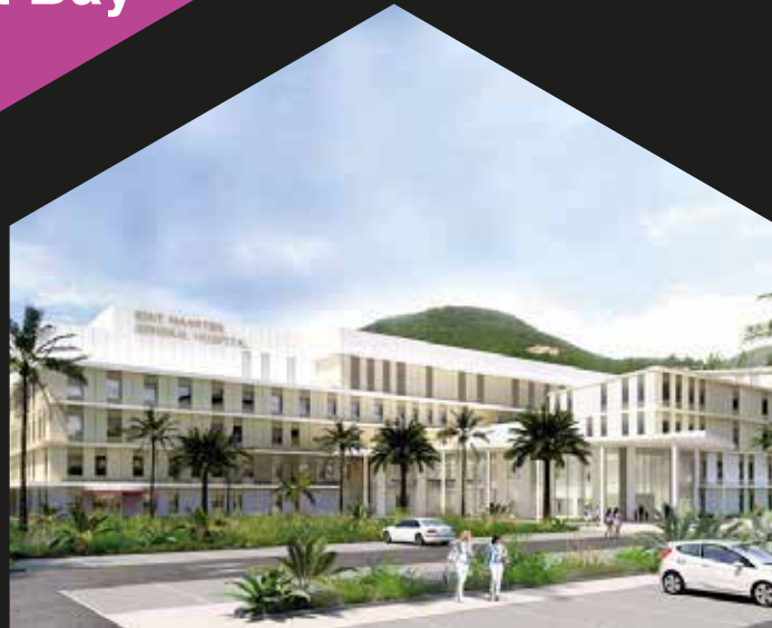
New General Hospital of St Maarten

A project with various types of bed lifts and lifts for hospital use.